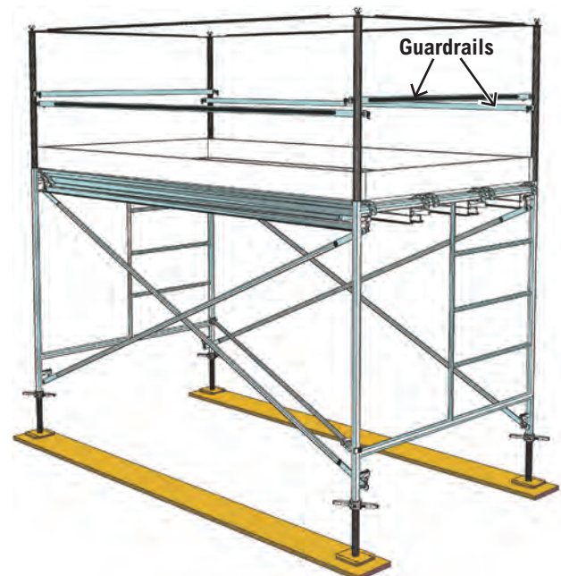
This is an example of a metal guardrail system.